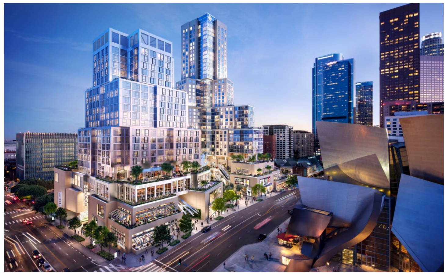
THE GRAND LA — DUSK VIEW WITH WALT DISNEY CONCERT HALL Renderings by Red Leaf, Courtesy of Related-CHEC